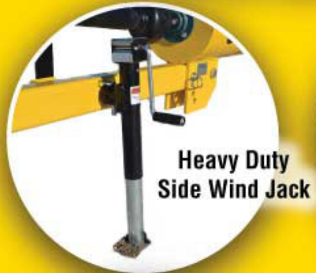
Heavy Duty Side Wind Jack