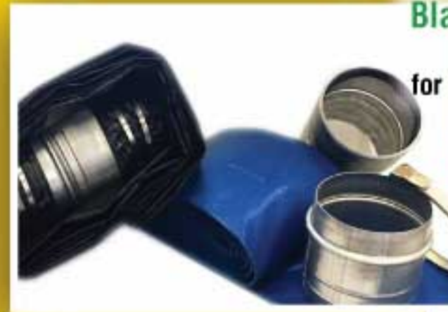
Black Polyester Hose 50ft x 12in Medium Duty 22 oz. Added Weave for Higher Tensile Strength & Durability with Aluminum Ring Lock Ends Blue Lay flat Hose 50ft x 12in Heavy Duty .118 wall with Aluminum Ring Lock Ends