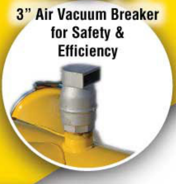
3" Air Vacuum Breaker for Safety & Efficiency