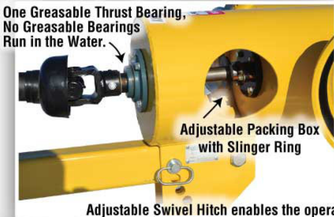
One Greasable Thrust Bearing, No Greasable Bearings Run in the Water.