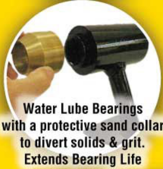
Water Lube Bearings with a protective sand collar to divert solids & grit. Extends Bearing Life