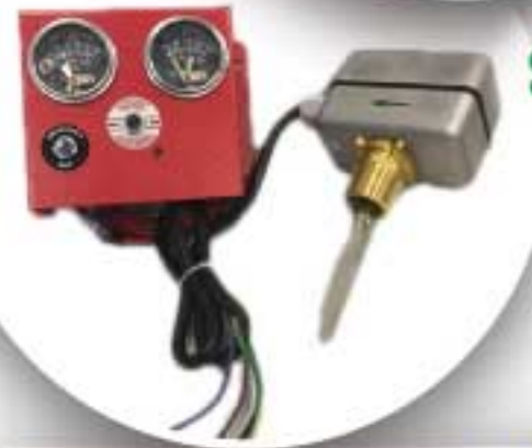
Safety Shut-Off Flow Sensor Will shut the tractor off when the pump runs out of water. Also protecting your tractor by monitoring oil pressure & water temperature.