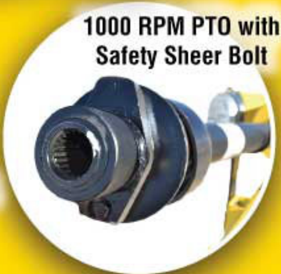
1000 RPM PTO with Safety Shear Bolt