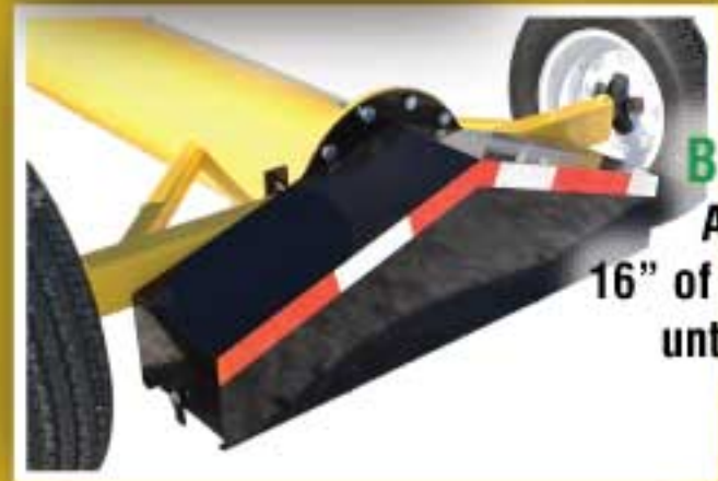
Bottom Feeder Attachment Allows the pump to prime in just 16" of water, & will continue pumping until the water is approx. 6" deep.

8973 Highway 1 S | Oakes, ND 58474 | 701-742-3224