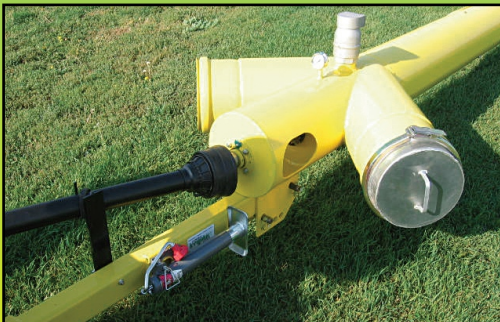
Left or Right Discharge